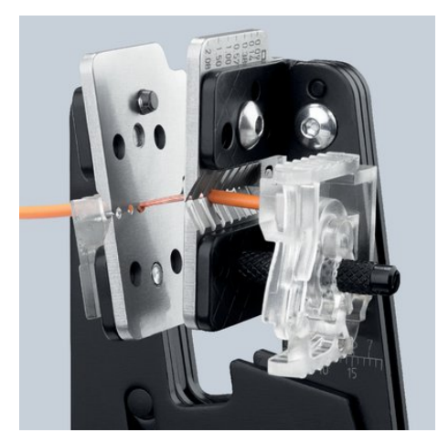
Positive stripping thanks to precise shape of the blades