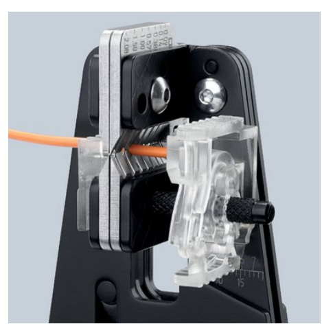
Precise cutting of the insulation to a complete extent